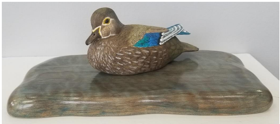
Wood Duck by Don Fromherz 1 st Place Winner

What a great showing by our Capitol Woodcarvers members who were all recognized at the show reception. Traditional fine-art artists were amazed by the quality and variety of our members' entries.