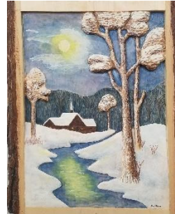
Early Winter by Tim Flora 2 nd Place Winner